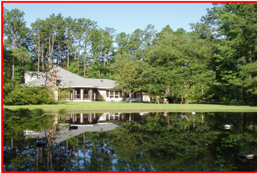
Big Casting Pond – Folsom, LA

Developed fly casting programs for the disabled and handicapped, and for cancer rehabilitation